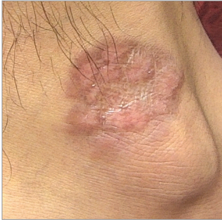
Figure 1. Necrobiosis lipoidica: Yellow-brown papules arranged at the periphery of an atrophic depressed area.