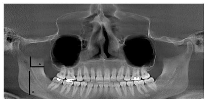
Figure 1. Measurement of A, B and C distances on CBCT scans to determine the position of mandibular foramen.