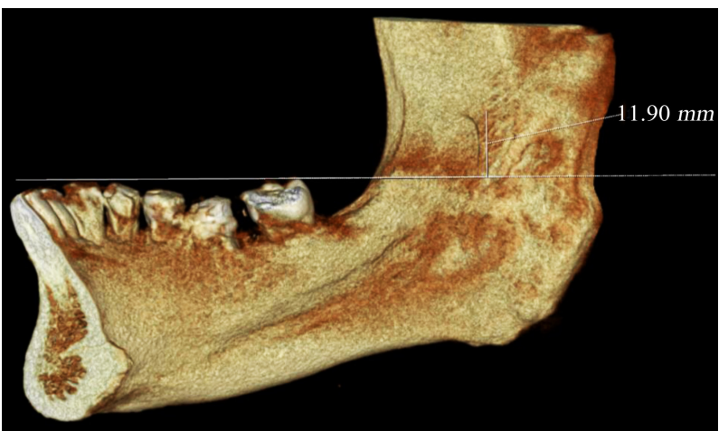
Figure 2. Distance between the occlusal plane and mandibular foramen measured on CBCT scans in NNT Viewer software.

the center of MF, and the line connecting the right and left premolars was measured on 3D CBCT scans (7) (Figure 3). The abovementioned distances were measured by the ruler feature of NNT Viewer software and reported in mm . The aforementioned angle was measured by the caliper feature of the software and reported in degrees. The age and gender of the patients were also recorded from patients' records available in the archives. Data (Mean± SD, Min, Max) were analyzed using IBM SPSS STATISTICS 24 (IBM Corp., Armonk, New York, USA) by Student t-test, bivariate correlation analysis, paired sample t-test, and Pearson's correlation coefficient.